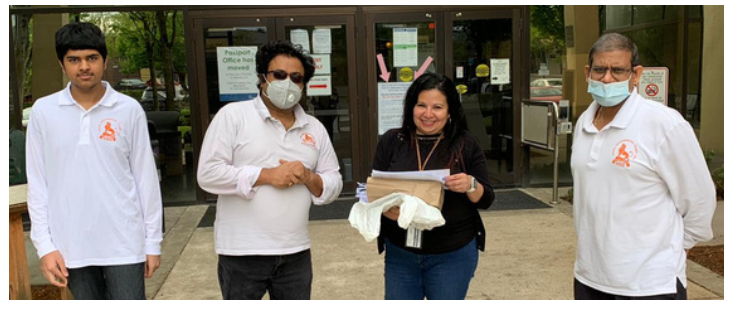
Swayamsevaks providing masks to a hospital in Seattle

HSS celebrates Raksha Bandhan as a Universal Oneness Day when volunteers tie a thread (Rakhee/Raksha) to each other and to the community leaders, to the first responders, etc. and express their commitment to protecting the society. At the time of printing of this report, Raksha Bandhan events were being conducted at several places. In some places our volunteers met Police, and the elected officials in person while maintaining social distance. However, many places HSS volunteers organized an online meeting with the elected officials from the local to the federal levels.