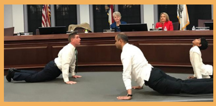
Mayor of Morrisville, NC performing Surya Namaskar

The thirteenth year of Surya Namaskar Yajna (SNY) was concluded on February 2, 2020. 82 public elected officials including mayors, governors, congressmen, and senators offered proclamations in their respective constituencies to promote this healthy activity among their constituents. This year, over 8,500 Yogathon enthusiasts from 36 states took part in this annual activity. HSS volunteers also engaged with the local schools and offered Surya Namaskar training to students, teachers, and administrative staff. This year 107 schools and 19,232 students took part in this activity and performed 115.032 Surya Namaskar. At many places, volunteers' enthusiasms led to 24 SNY Marathon where a group of participants performed sets of Surya Namaskar in a relay manner for 24 hours.