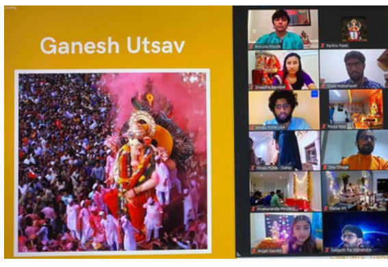
Samuhik Ganesh Utsav by 36 chapters of Hindu YUVA