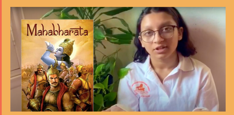
A kishore from Dharma Internship Program presenting story of Mahabharat

Over 120 adult mentors including many University students joined in and volunteered to help the interns in the projects and in the learning modules.